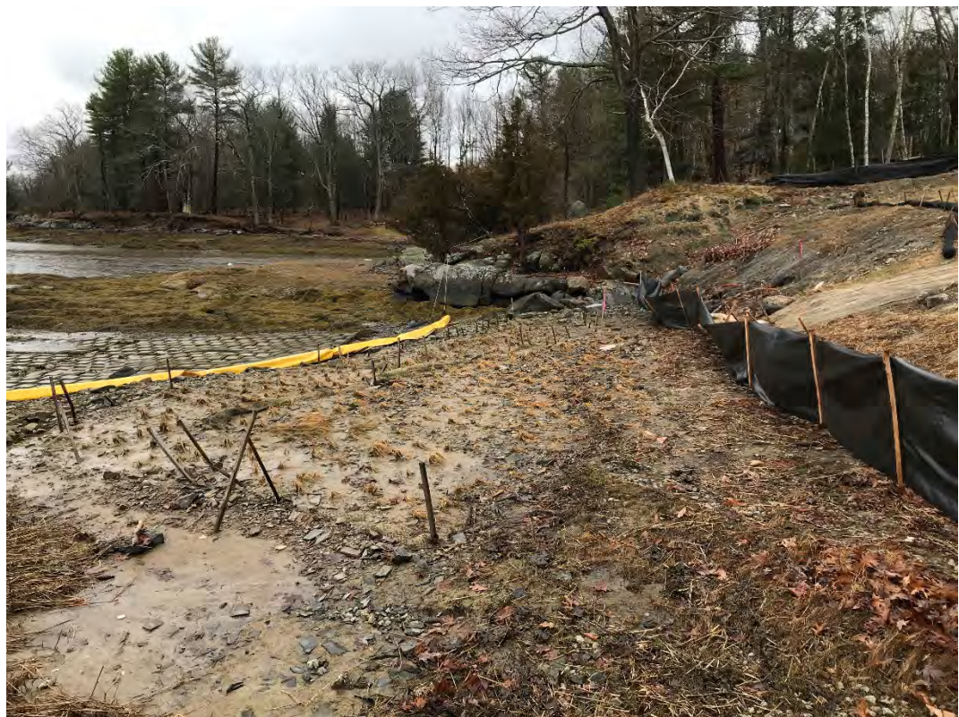
Fig 4: Toe of the slope and salt marsh restoration at the Eversource property/west side of the bay. Viewing south. (04-01-21)