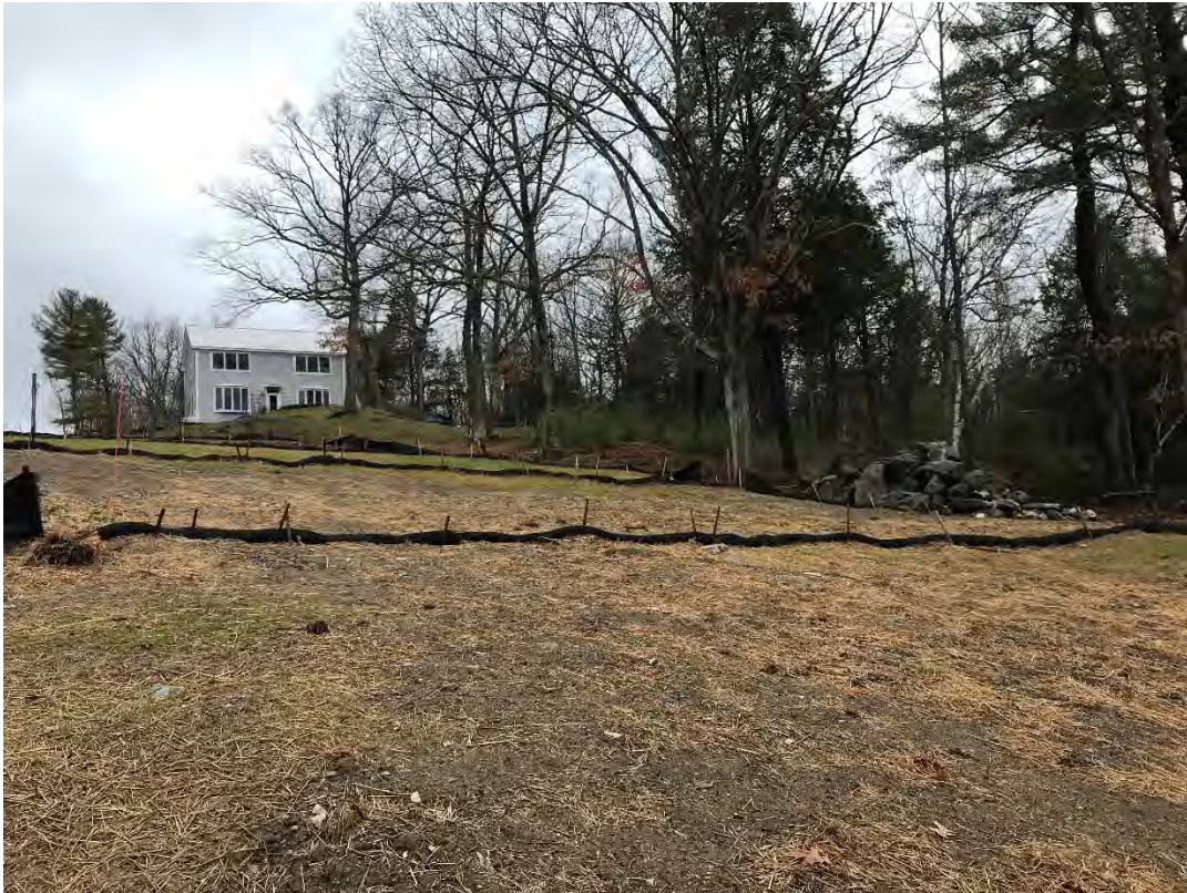
Fig 3: Slope above the cable house at the Eversource property/west side of the bay. Viewing northwest. (04-01-21)