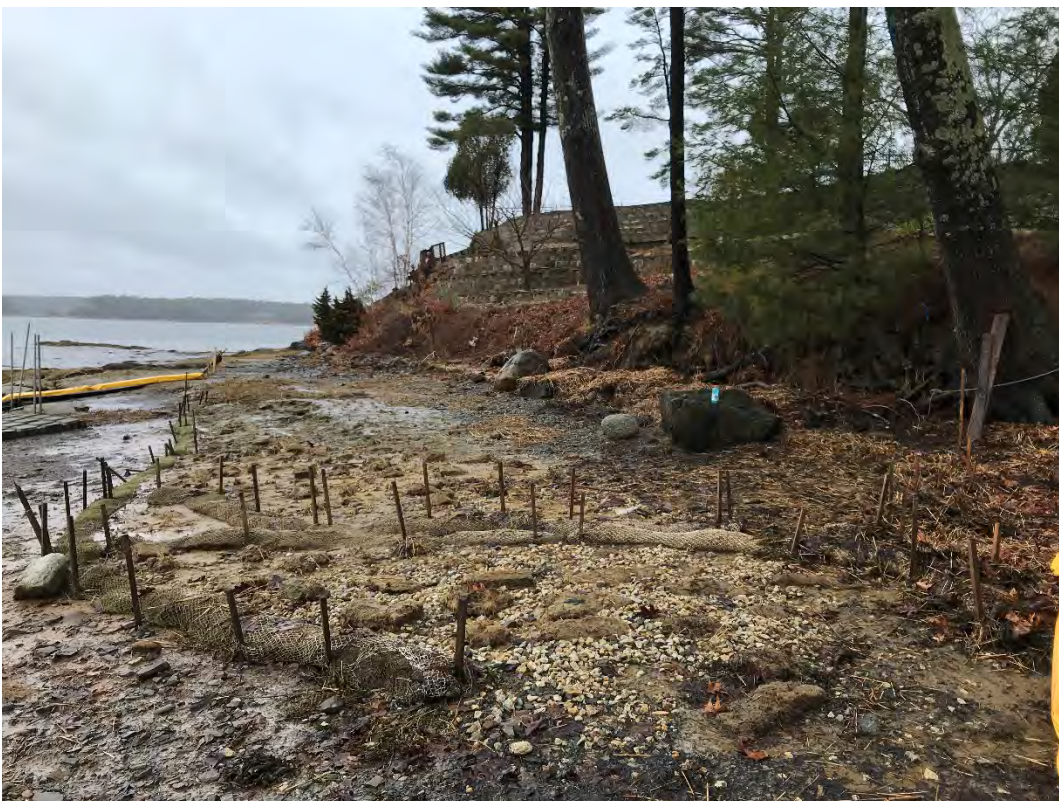
Fig 12: Salt marsh restoration at Gundalow Landing/east side of the bay. Viewing south. (04-01-21)