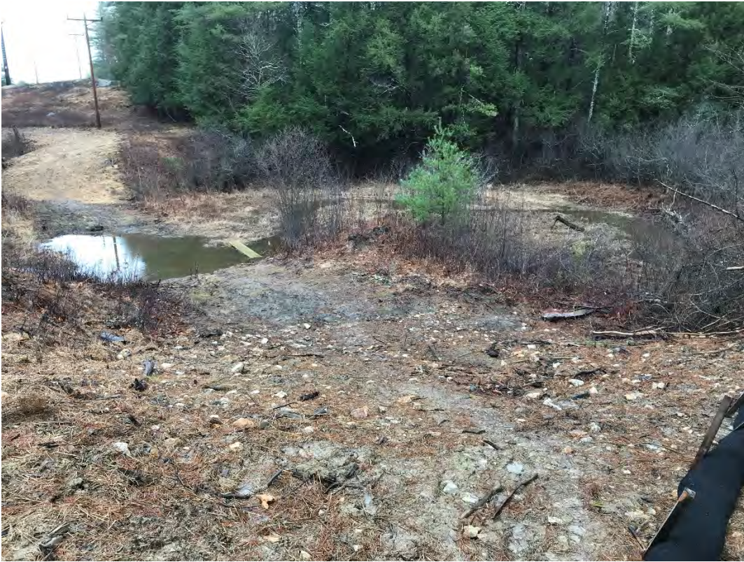
Fig 7: Stream DS46 between Strs. 51 and 52. Viewing northeast. (04-01-21)