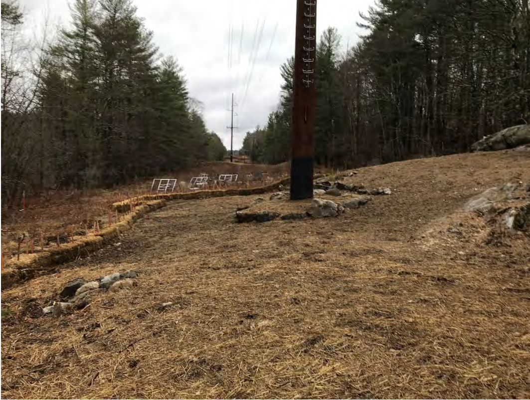
Fig 5: Str. 89 work area. Viewing southeast. (04-01-21)