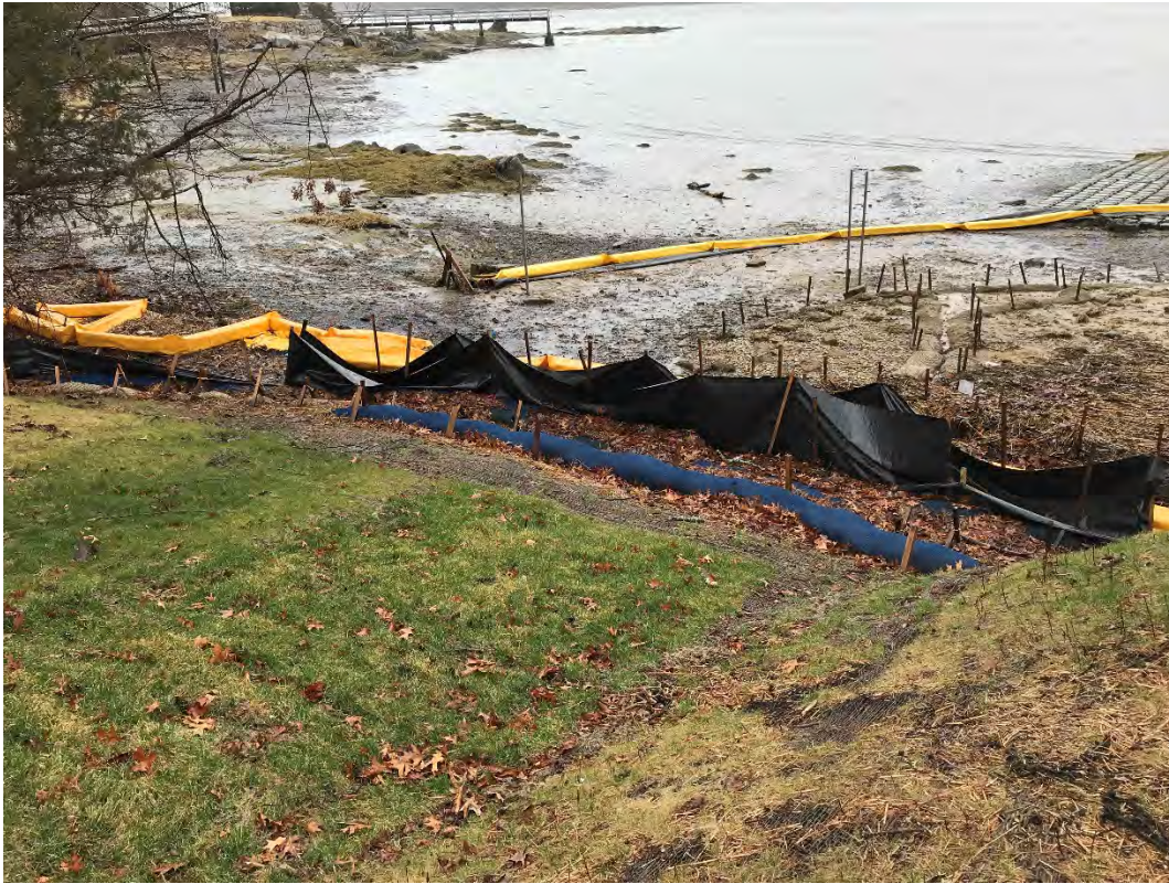
Fig 11: Toe of the slope at Gundalow Landing/east side of the bay. Viewing south. (04-01-21)