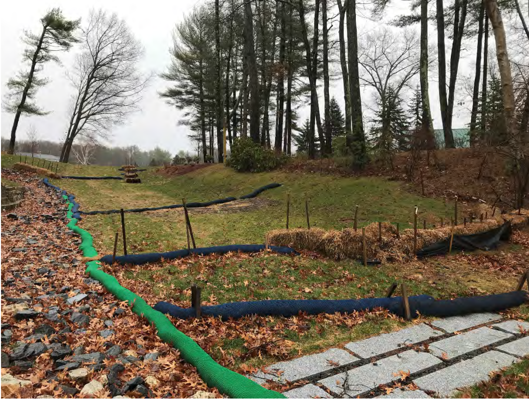
Fig 9: Slope above the manhole at Gundalow Landing/east side of the bay. Viewing east. (04-01-21)