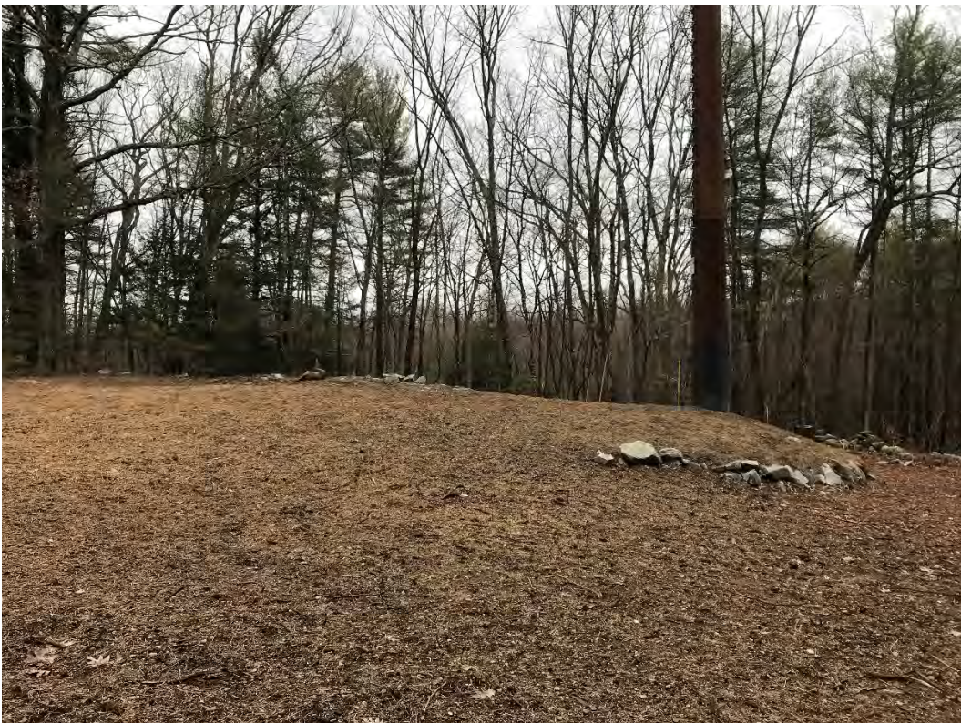
Fig 6: Str. 90 work area. Viewing northeast. (04-01-21)