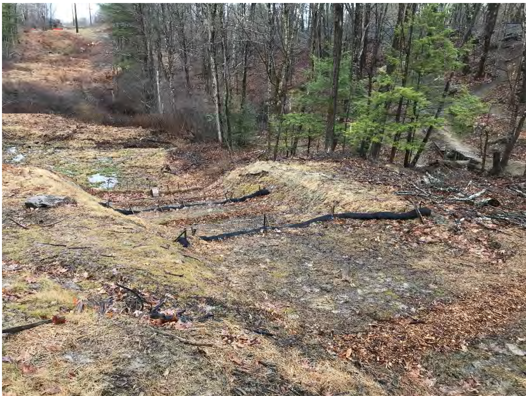
Fig 8: Lower portion of slope between Strs. 28 and 29. Viewing northeast. (04-01-21)