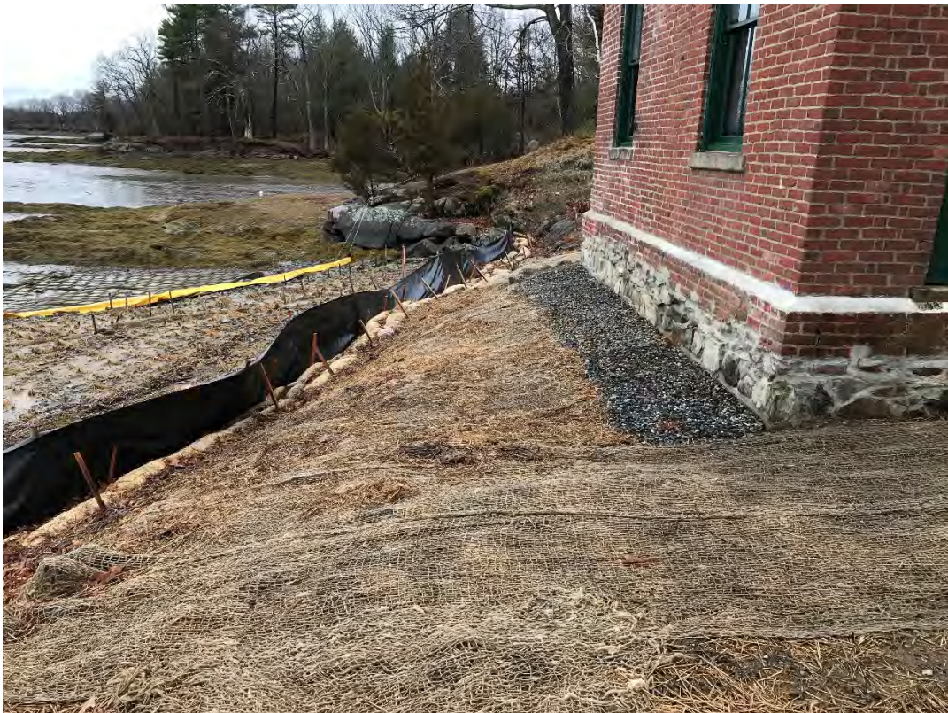
Fig 2: Slope between the cable house and salt marsh restoration at the Eversource property/west side of the bay. Viewing south. (04-01-21)