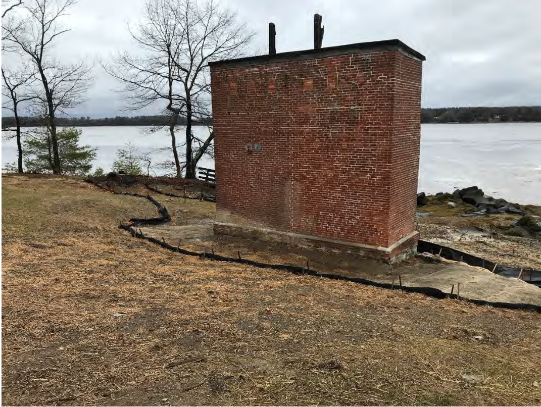
Fig 1: Slope leading down to cable house and salt marsh restoration at the Eversource property/west side of the bay. Viewing northeast. (04-01-21)