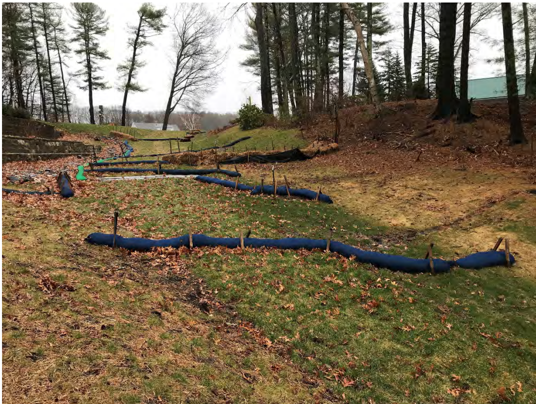
Fig 10: Slope below the manhole at Gundalow Landing/east side of the bay. Viewing east. (04-01-21)